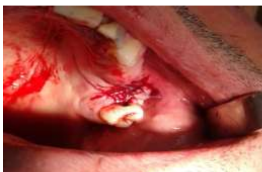
Fig.4 – Alveolus sutured with simple interrupted suture

The edges of the alveolus are stitched with a simple interrupted suture or eight-like suture using absorbable or non-absorbable thread 000 – Fig. 4.