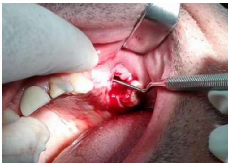
Fig. 1 – Presence of oroantral communication in the area of tooth 26

After extraction the presence of OAC is determined by asking the patient to exhale gently through his nose while his nostrils are pinched (Valsalva test). If necessary, patients were examined clinically to assess the OAC by propping it with a blunt prop (small curette) - Fig. 1.